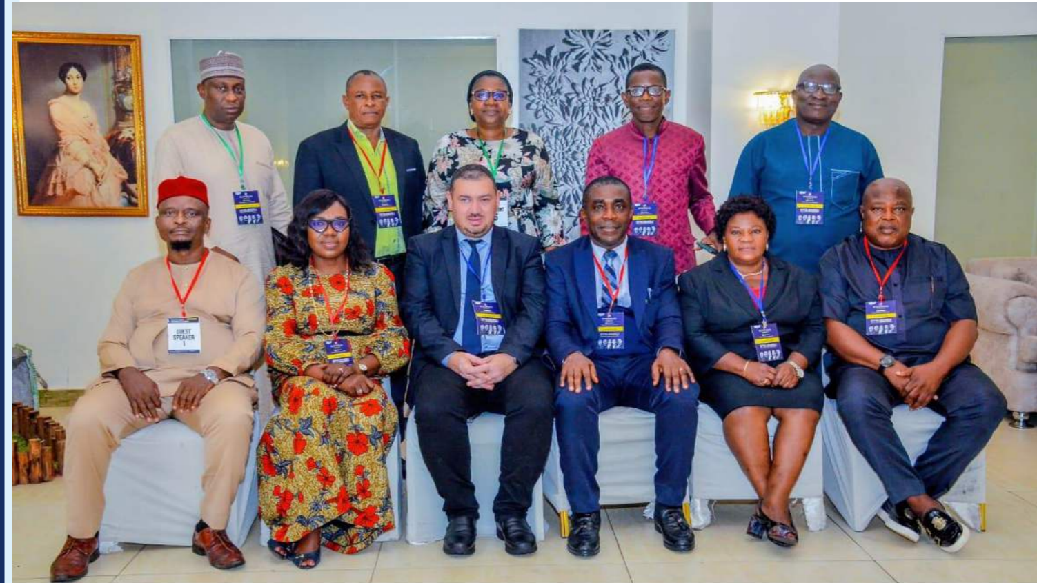
Participants at the Federal Ministry of Transportation (FMOT) Executive Workshop on ARTIFICIAL INTELLIGENCE AND GPT-4 FOR FINANCE PROFESSIONALS Held at The Palms Hotel Abuja on 11 – 12 September 2024 Organised by West Africa Business School