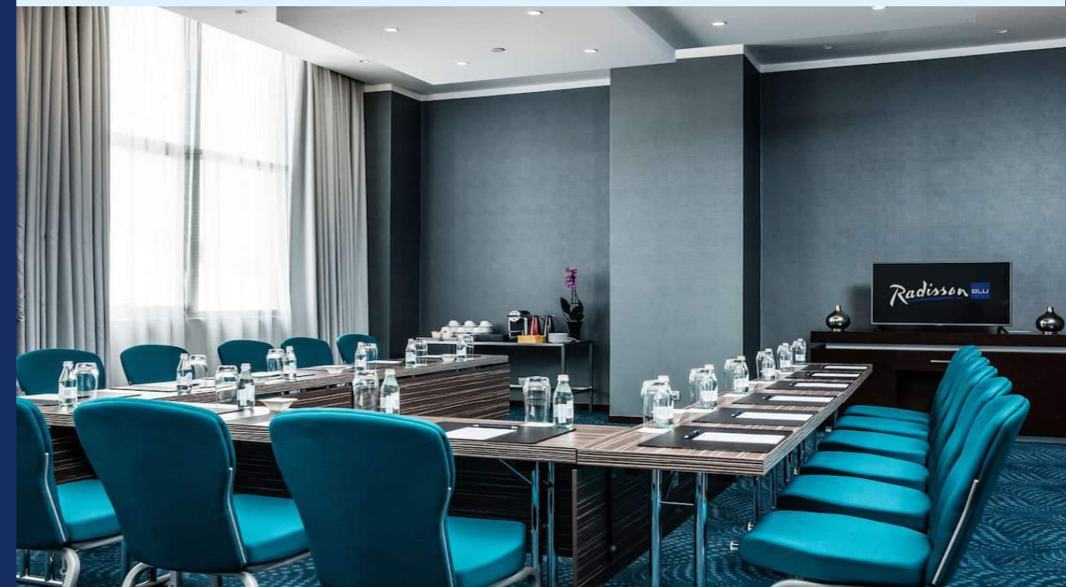
Radisson Blu Hotel Nairobi, Upper Hill-Training Room