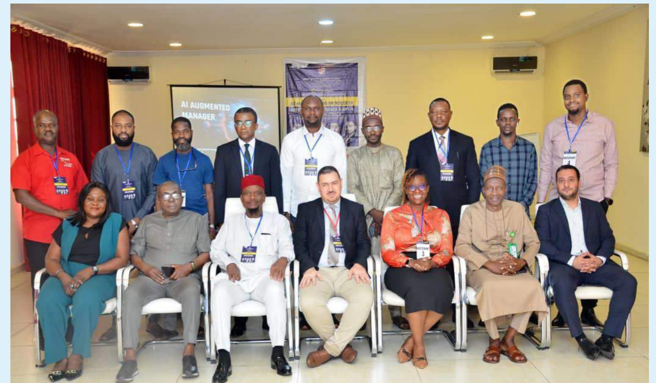
CROSS SECTION OF PARTICIPANTS AT THE ARTIFICIAL INTELLIGENCE & GPT- 4 MASTER CLASS. HELD AT THE PALMS HOTEL CBD ABUJA. ON THE 6-7 MAY 2024 ORGANIZED BY WEST AFRICA BUSINESS SCHOOL