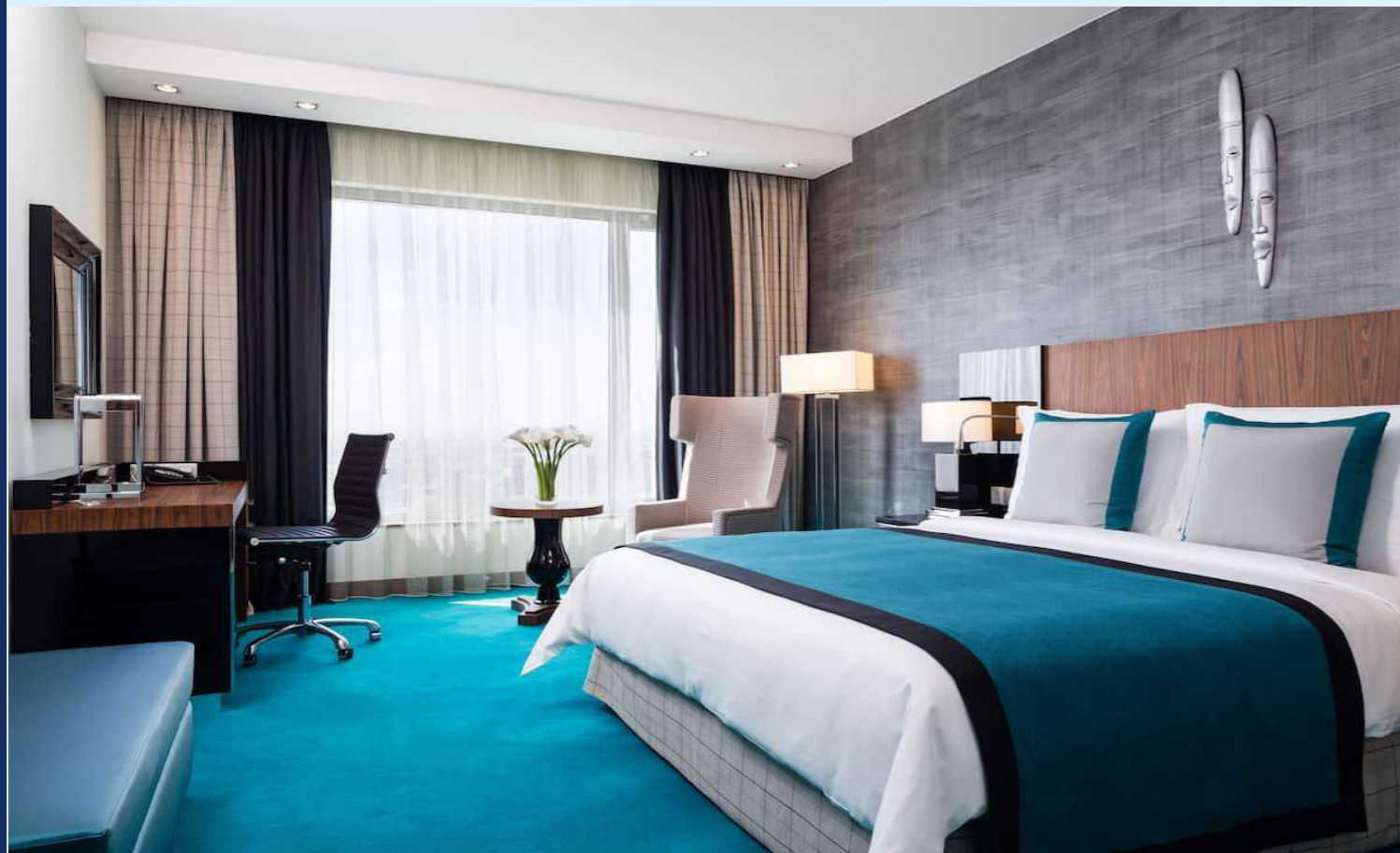
Participants Room: Radisson Blu Hotel Nairobi, Upper Hill