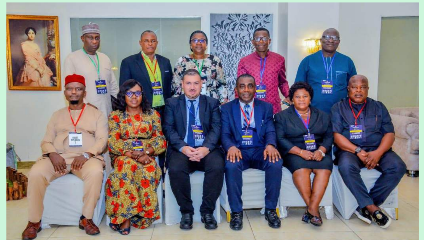
Participants at the Federal Ministry of Transportation (FMOT) Executive Workshop on ARTIFICIAL INTELLIGENCE AND GPT-4 FOR FINANCE PROFESSIONALS Held at The Palms Hotel Abuja on 11 – 12 September 2024 Organised by West Africa Business School

West Africa Business School can also do this course as a tailor-made in-house course to meet organization-wide needs. Contact us to find out more: wabs.edu@gmail.com